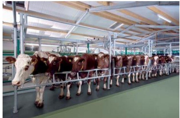
Herringbone or Parabone Stall - Any parlor stall holding the cow at an angle less than perpendicular but greater than horizontal to the operator.