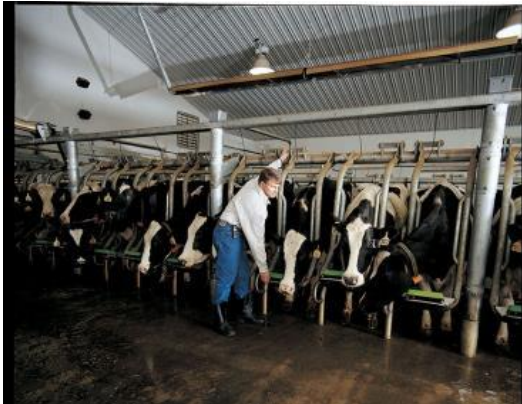
Parallel Stall - Holds the cow perpendicular to the operator (milking unit is attached from behind the cows, between her back legs).

Stalls are reported on a cow place basis. For example, a Double 12 Herringbone or Parallel would be reported as 24 stalls.