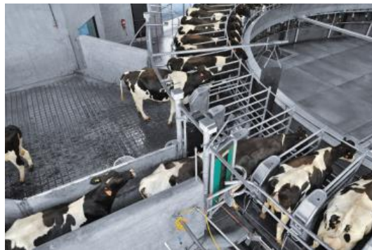
Rotary Stall - Any stall on a moving platform, which revolves around a central axis. These stalls may be either a herringbone (cows milked from inside) or parallel (cows milked from the outside).